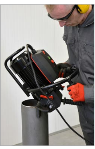
Pipe beveling (option)