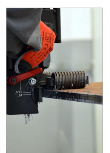
Plate facing-off (option)