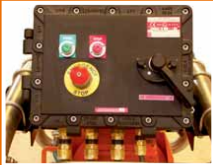
Cast electrical Ex box with main switch, star delta starter and overload relay.