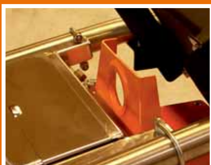
One centralized and balanced lifting eye.