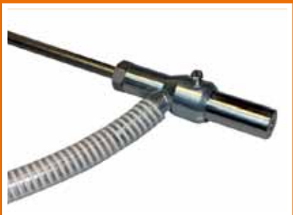
Sand Blasting Equipment