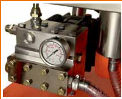
Stainless steel pump-head. Integrated unloader valve.