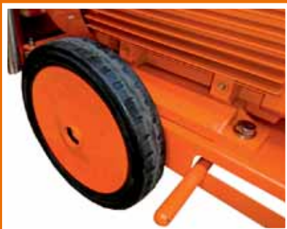
Galvanized frame with built in brake and solid wheels.