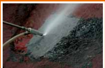
Surface - Sand blasting