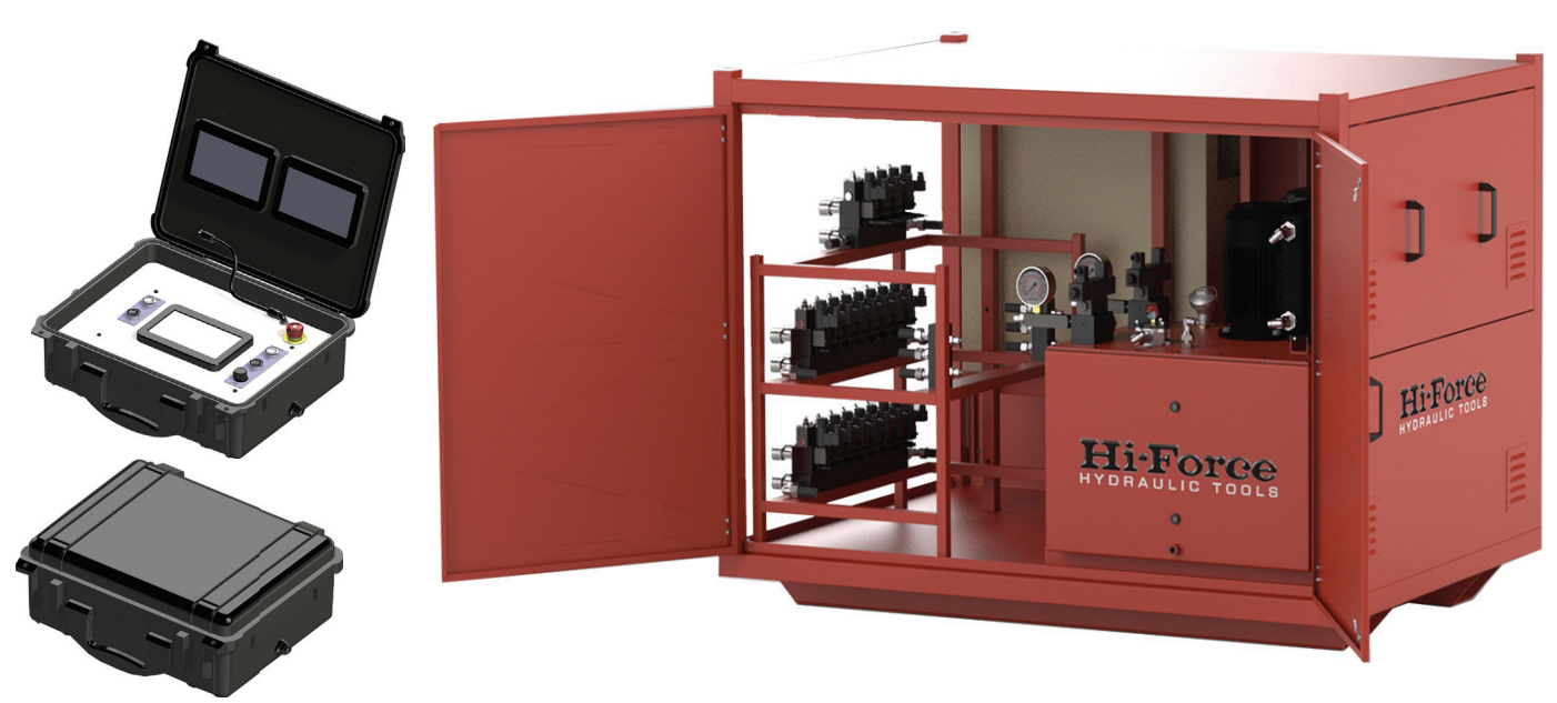
Control unit complete with multiple screens (depending on configuration and monitoring requirements) and USB port, supplied on a cable for remote operation.