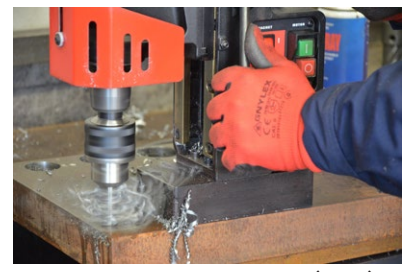
Drilling capacity up to 16 mm (0.63")