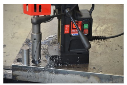
Milling capacity up to 55 mm (2.17") Depth of cut up to 75 mm (3")