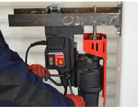
Out of position drilling