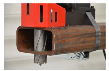
Starting point of milling up to 50 mm (2") below a level of a drill base