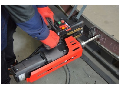
Out of position drilling