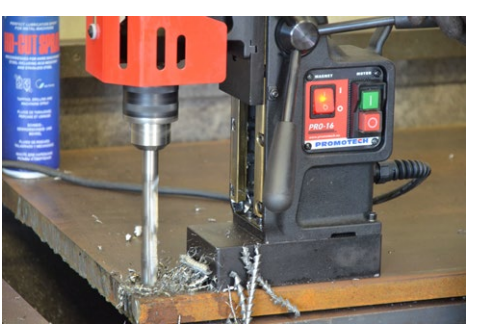
Drilling capacity up to 16 mm (0.63")