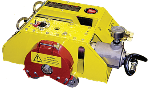
MODEL E PNEUMATIC