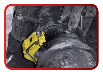
First introduced in 1949, Trav-L-Cutters are highly durable and in use all over the world